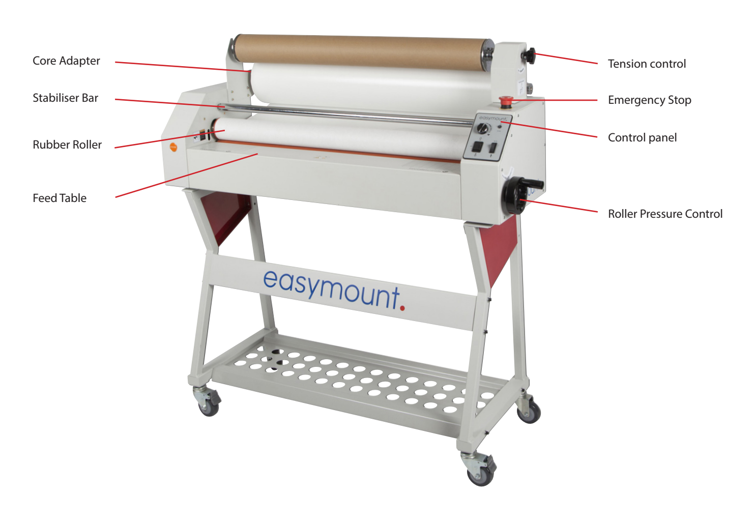
Easymount Sign EM-880

Should you experience any problems please contact your supplier for further information.